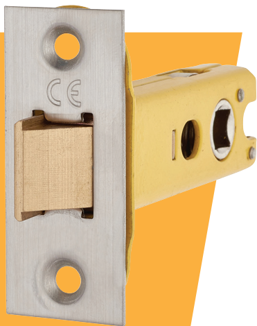
Altro Heavy Duty Tubular Latch - 78mm Case - 57mm Backset - Satin Stainless Steel

These must also be selected carefully to ensure compliance. As stated above, fitting a non-CERTIFIRE approved component to a CERTIFIRE door will invalidate the certification, so checking for this approval is one of the primary considerations when selecting latches. It is also essential that the fire rating for the latch supports the rating of the door set as a whole. For example, if a door set with a 60-minute fire rating is required, fitting a latch that only has a 30-minute rating would undermine the performance of the door assembly. In addition, the design of the latch must ensure it will reliably secure the door, so a positive return action from the latch spring is essential. Finally, as with all door hardware it must be suitable for the application and the level of use it will need to withstand.