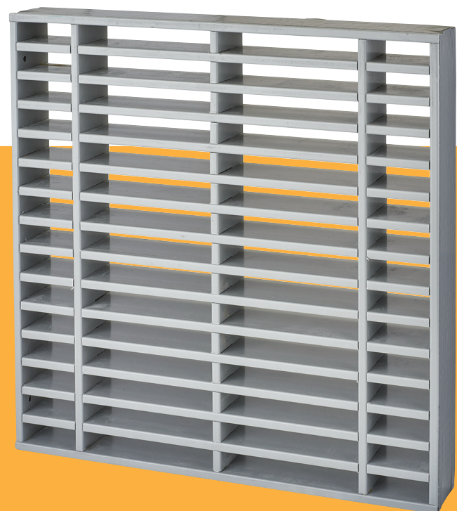
Lorient LVV40 Intumescent Air Transfer Vent - 300 x 300mm