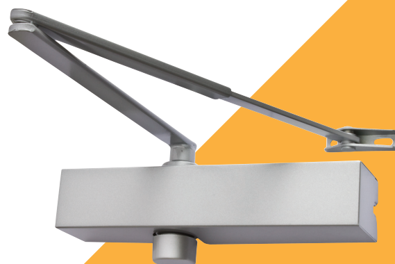
Arrone AR3500 Fire Door Closer - Silver

To ensure the door set also meets the requirements of access regulations, it may be advisable to look for a closer that allows the power to be adjusted on site. For example, the CERTIFIRE approved, medium duty Arrone® AR3500 Door Closer can be fitted to interior and exterior doors up to 1100mm wide or 80kg and has a 120-minute fire rating. It is also adjustable and meets the guidance of BS 8300 for accessibility.