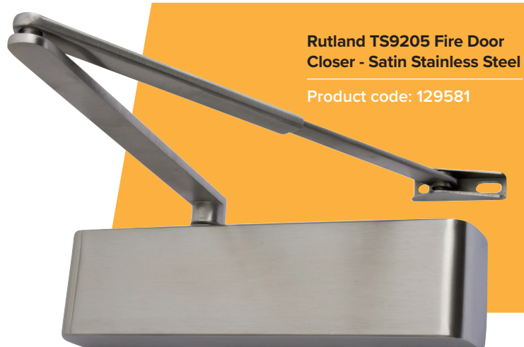
Rutland TS9205 Fire Door Closer - Satin Stainless Steel

A possible solution is selecting a door closer with a delayed action feature, such as the Rutland® TS9205 , to allow more time for people to pass through before the door begins to close. It is also power adjustable and is capable of meeting BS 8300 accessibility guidelines.