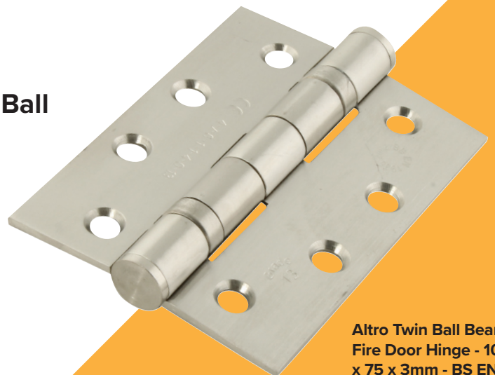
Altro Twin Ball Bearing Fire Door Hinge - 100 x 75 x 3mm - BS EN Grade 13 - Stainless Steel - Pack of 3

For an ideal solution, our Altro Twin Ball Bearing Fire Door Hinge is sold in packs of three and is certified to BS EN Grade 13, meaning it has been tested up to 200,000 cycles. It has a 60-minute fire rating and is suitable for fire doors up to 120kg.