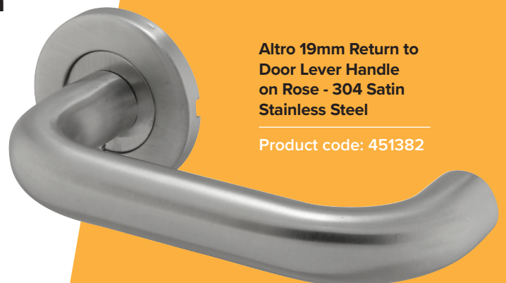
Altro 19mm Return to Door Lever Handle on Rose - 304 Satin Stainless Steel

As an example, the Altro 19mm Return to Door Lever Handle is made from 304 grade stainless steel for low maintenance longevity. The return to door design of the crank also meets the guidelines of BS 8300, making it ideal for public environments such as hospitals and schools.