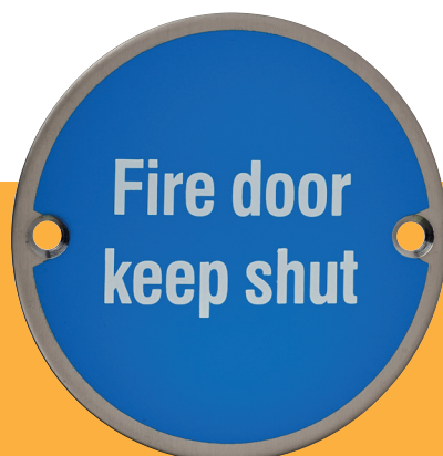
Fire Door Keep Shut - 75mm Diameter - Satin Stainless Steel

In addition, when fire doors are propped or wedged open they provide no protection, so the regulations also require that fire doors be clearly marked with a safety sign such as 'Fire door keep shut' to remind people not to prevent it from closing. At IronmongeryDirect we have a wide range of safety signage, including fire door signs.