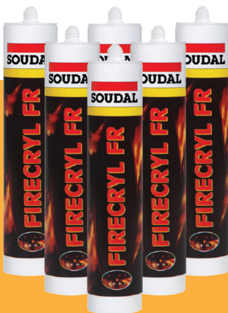
Soudal Firecryl FR - Trade Multipack - 310ml - White - Pack of 6

Similarly, where there are holes, joins or seams in a fire resisting wall, such as around pipe and service penetrations or between floors and walls, intumescent acrylic sealants such as Soudal Firecryl FR can be used. This can be applied in a range of interior areas, including on porous surfaces and is fire rated up to 4 hours in compliance with BS EN 1366.