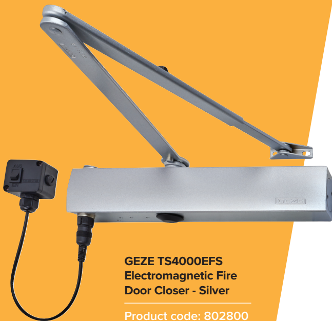
GEZE TS4000EFS Electromagnetic Fire Door Closer - Silver

Another option is to select hold-open devices that will keep the door open until a fire alarm is triggered, at which point it releases the door to close under the force from the door closer. These can either be ones linked directly to the alarm system or operate as a standalone unit. These devices must be CE/UKCA marked BS EN 1155 as per legal compliance.