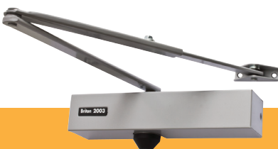
Briton 2003 Fire Door Closer - Silver

Selecting the correct door closer for each application can help ensure compliance with the regulations, provide easy use of the building for occupants and keep maintenance, repair and replacement costs down.