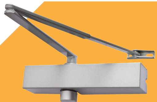
Arrone AR3500 Fire Door Closer - Silver

Alternatively, electro-mechanical door operators can be used to ensure the door can be opened with minimal force. These can either provide fully automatic opening, using a push pad button, or offer assisted operation to minimise the force required.