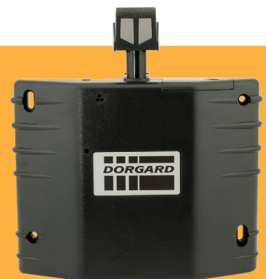
Dorgard Fire Door Holder - Black

Delayed action or hold open devices also have an additional advantage in reducing the temptation for building occupants to prop or wedge the door open to prevent it closing automatically.