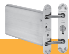
Powermatic R100 Hydraulic Concealed Fire Door Closer - Satin Chrome