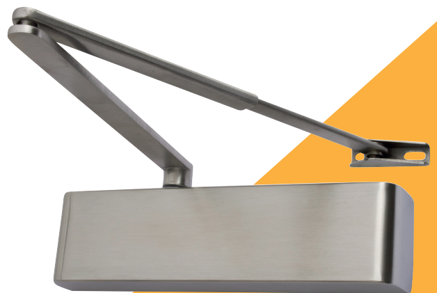
Rutland TS9205 Fire Door Closer - Satin Stainless Steel